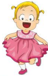
Ann is wearing a beautiful dress.