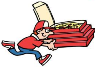
Joe delivers pizza.