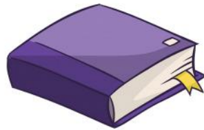
The book is interesting.