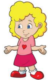
My sister is nice.