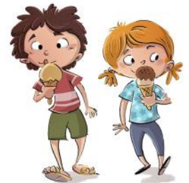
My sister and I love ice-cream.