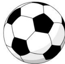
The ball is black and white.