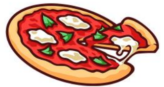
The pizza is delicious.