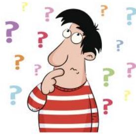
I don't know the answer.