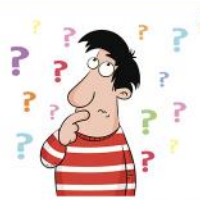
I don't know the answer.