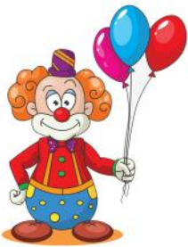
The clown is funny.