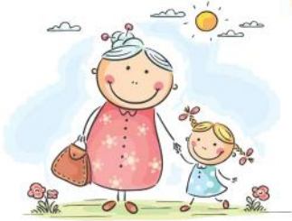
My grandma and my sister are walking.