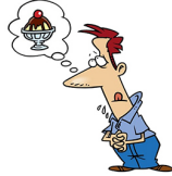
Ramon is hungry. (often)