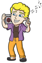
He listens to the radio. (often)