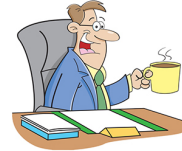
I drink coffee. (sometimes)