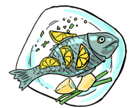
We have fish for dinner. (seldom)