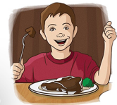
I eat meat. (seldom)