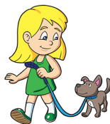
My sister walks the dog. (often)