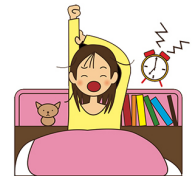
You get up late. (never)