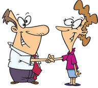
Tom is very friendly. (usually)