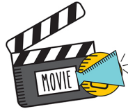
They go to the movies. (often)