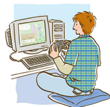
He uses the computer. (always)