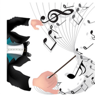
She listens to classical music. (rarely)