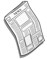
He reads the local newspaper. (sometimes)