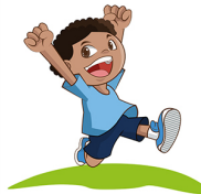
I am happy. (always)