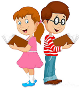
They read a book. (sometimes)