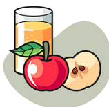
They drink orange juice. (never)