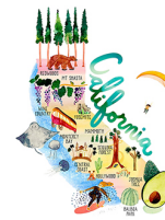
It rains in California. (never)