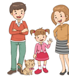
They visit their aunt on Sunday. (sometimes)