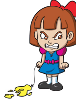
Sara smiles. (never)